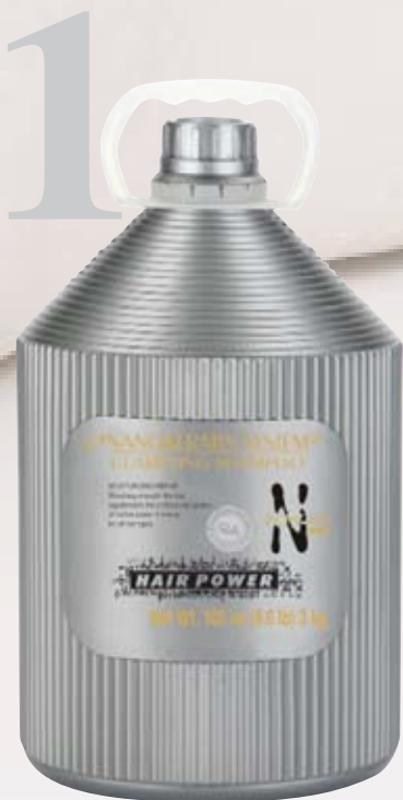
Net Wt. 105 oz (6.6 lb) 3 kg For 120 treatments