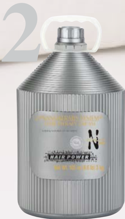
Net Wt. 105 oz (6.6 lb) 3 kg For 60 treatments